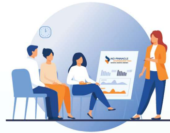
Events, Training & skill development programs