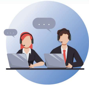
Functional Support - Legal Advice, HR Support, Marketing support