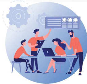
Mentoring prototype, product development, & commercialization