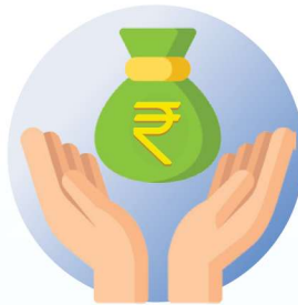
Funding done by incubator