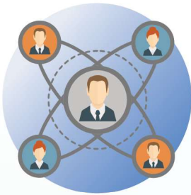
Networking – Investor, Corporate, Government etc.