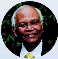
Dr. R. A. Mashelkar Chief Mentor, Padma Vibhushan Awardee